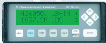
To power and display Torque only, use a Model 703+. To power and display Torque, Speed and HP, use a Model 723+. See Bulletins 372 & 374.

*NIST traceable calibration performed in our accredited laboratory (NVLAP Lab Code 200487-0). For details visit www.himmelstein.com or follow the accreditation link at www.nist.gov .